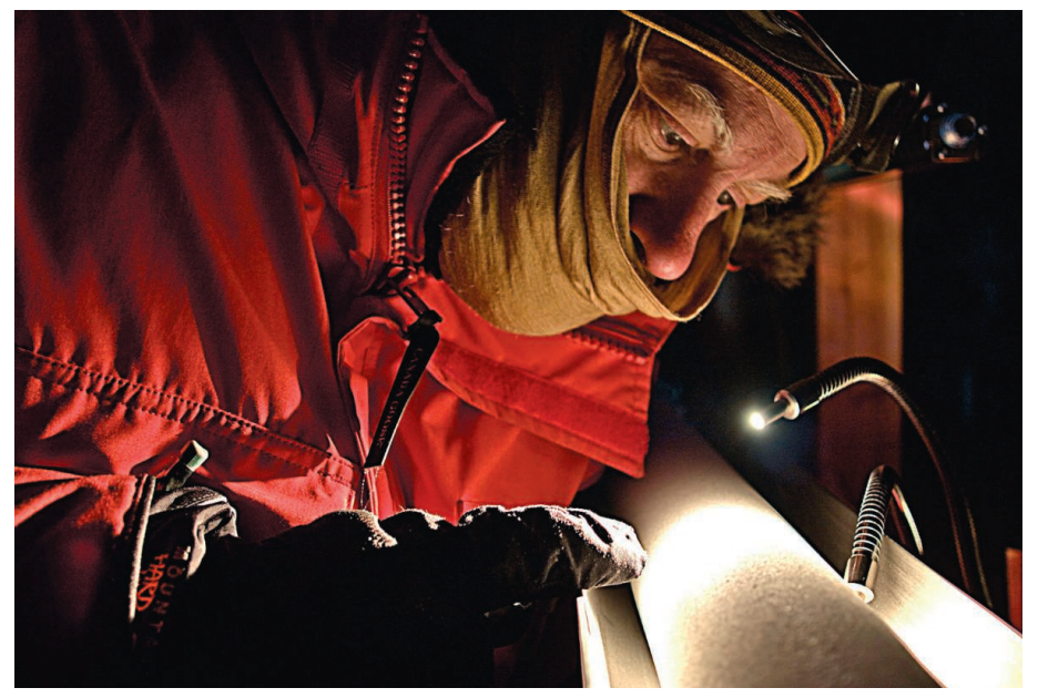
Closer look. An exceptionally detailed Antarctic ice-core record shows that expanding rice cultivation, plus natural forces, kicked off global warming 5000 years ago.

Delving into the archaeological literature, Ruddiman noted that the methane increase occurred at about the same time as people started cultivating rice in what were essentially manmade, methane-producing wetlands. The